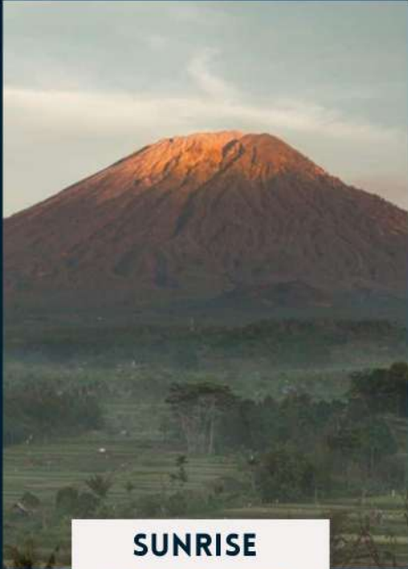
SUNRISE AGUNG HIKE

Towering over 2,000 meters, Mount Agung is spiritually significant to the Balinese and home to the Mother Temple of Besakih, which you'll visit after the trek.