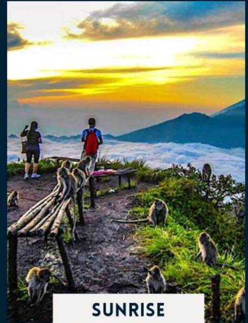
SUNRISE BATUR HIKE

Mount Batur is one of Bali's sacred mountains, revered in Hindu culture. This tour offers the unforgettable experience of trekking to the summit to witness a spectacular sunrise. The trek begins early in the morning and takes about 2 hours to reach the sunrise viewpoint, where you'll enjoy breakfast with breathtaking views.