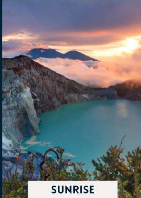
SUNRISE IJEN HIKE

Embark on an advanced trekking adventure to the Ijen Crater in East Java. This trek requires good physical fitness, with a 60-90 minute hike to the crater rim at 2,300 meters elevation. For those seeking an extra challenge, a 30-minute descent takes you to the crater's edge, where you can witness the sulfur mining operation and the world's largest acidic crater lake. At night, marvel at the rare blue flame phenomenon as it escapes through cracks in the crater—an unforgettable sight.