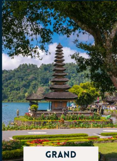
GRAND LOVINA TOUR

Discover the beauty and culture of North Bali on this immersive day trip. Begin with a trek to the stunning Git-Git Waterfall, followed by a visit to the iconic Ulun Danu Temple at Beratan Lake. Explore the vast Botanical Garden, Indonesia's largest, featuring rare tropical plants. Along the way, visit traditional fruit and flower markets, Munduk's coffee plantations, and enjoy breathtaking views of the Twin Lakes. End your journey at an ancient village where locals still practice traditional handicrafts.