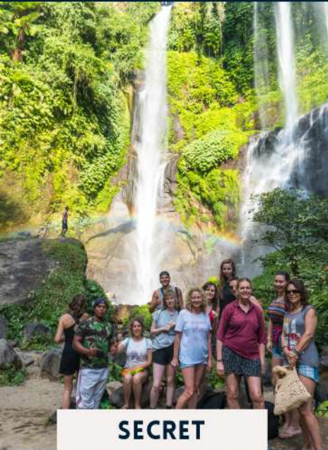
SECRET GARDEN TOUR

Discover the hidden beauty of North Bali with the Secret Garden Trekking Tour. Explore the lush green hills between Sambangan and Ambengan villages, visiting stunning waterfalls including Blue Lagoon, Aling-Aling, Kroya, and Pucuk. Along the way, enjoy thrilling activities like sliding, jumping, and swimming, or simply soak in the breathtaking surroundings. This adventure offers an unforgettable blend of excitement and natural beauty.