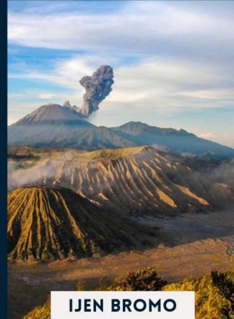
IJEN BROMO HIKE

Though not the tallest, Mount Bromo is one of Indonesia's most iconic and visited active volcanoes. This trip offers a bucket-list adventure where you can peer into an active volcano and take in breathtaking landscape views. With minimal hiking effort, this tour combines the thrill of volcanic exploration with the beauty of East Java's stunning scenery, making it a must-do for adventure seekers.