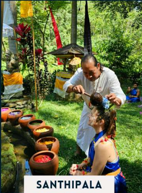
SANTHIPALA YOGA TOUR

Journey to the sacred Holy Santhipala Waterfall, a place known for its healing energy and spiritual retreats. Many spiritual leaders have meditated here, and now we invite you to experience its powerful energy. You'll participate in a special 7 Chakras Cleansing Purification Ceremony and meditation by the waterfall. Afterward, enjoy a peaceful stop at an organic farm for lunch, surrounded by nature.